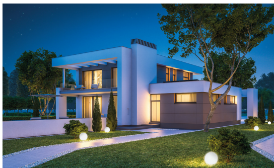
Light source shape: swieczka