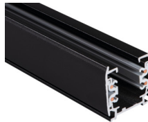
33233 TEAR N TR 2M-B

Track system component, TEAR N TR 2M-B, 3-circuit track, black, (33233)